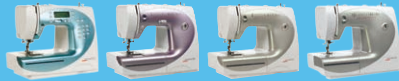
for BERNINA bernette® 92c for BERNINA bernette® 82e for BERNINA bernette® 66 for BERNINA bernette® 56